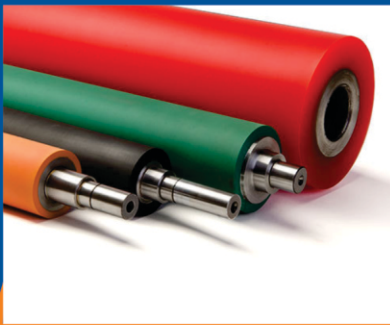
Plastic Printing Packaging