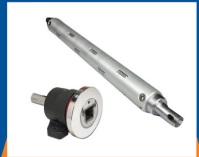
Air Shaft / Safety Chucks