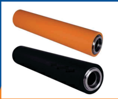
Rotogravure Printing Roller