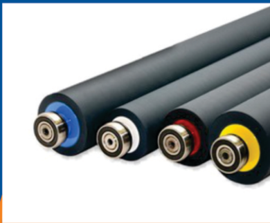
Precision Rubber Roller